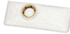
Fuel pump inlet filters