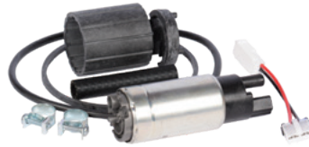
Electric fuel pump kits