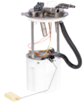
Electric fuel pump modules & assemblies

Bosch supplied the industry's first fuel injection system with a high pressure electric fuel pump in 1967. Since then, Bosch has continued to be at the forefront of fuel system technology, and is recognized throughout the industry for innovation and superior product quality. Today Bosch brings its fuel system expertise to the aftermarket with a premium fuel pump program for Domestic, Asian and European vehicles, including: