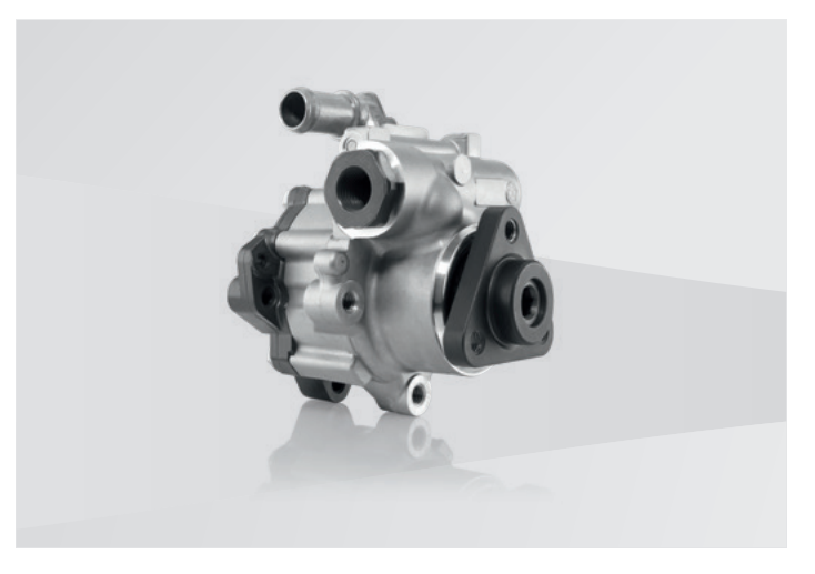
Mechanical (dual circuit)