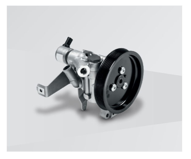
Electric Hydraulic Power Steering